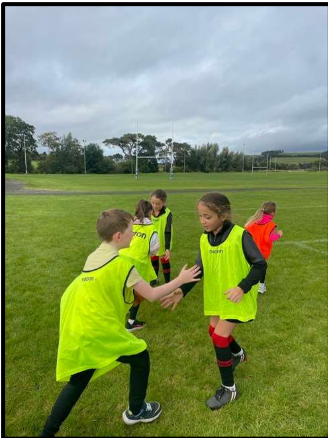
Biggar Learning Community Rugby Festival

We welcome any comments or additional information from parents to help us provide the best possible education for your child.