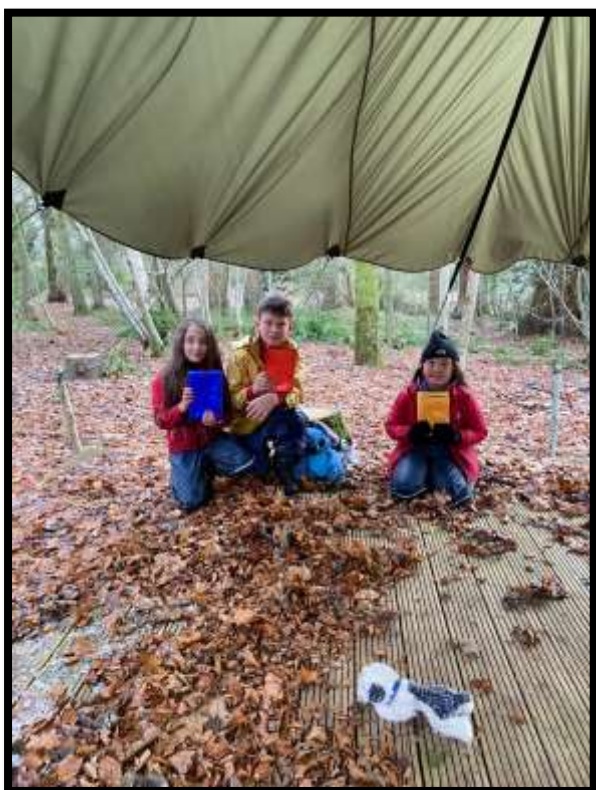
Outdoor learning at Wiston Lodge

For Education Resources this means delivering services of the highest quality as well as striving to narrow the gap. It is about continually improving the services for everyone at the same time as giving priority to children, young people, families, and communities in most need. The priorities for schools and services are set out in the Education Resources Plan which confirms the commitment to provide better learning opportunities and outcomes for children and young people. This is available at Education Resources Plan 2025/26 Education and learning - South Lanarkshire Council